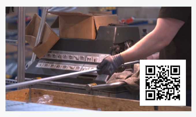
Tube service Ready-to-install tubes and sets of tubes

Custom-made forgings and large and demanding special components