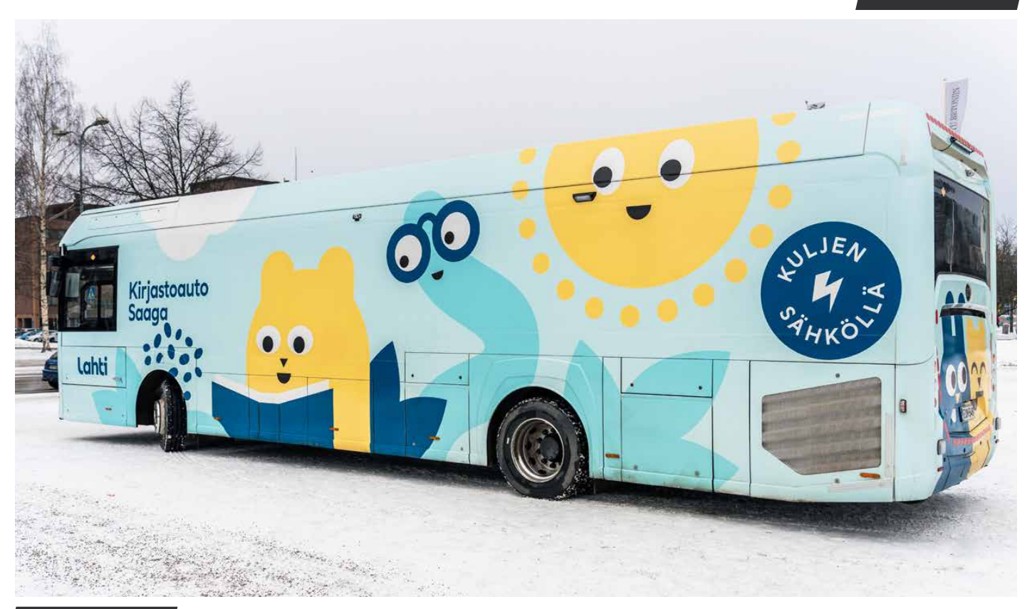
The mobile library designed for the City of Lahti is an innovative and environmentally friendly solution.