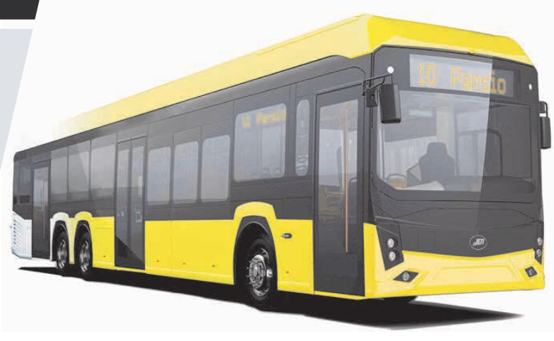
Jeti Industries Ltd works for an emission-free future.