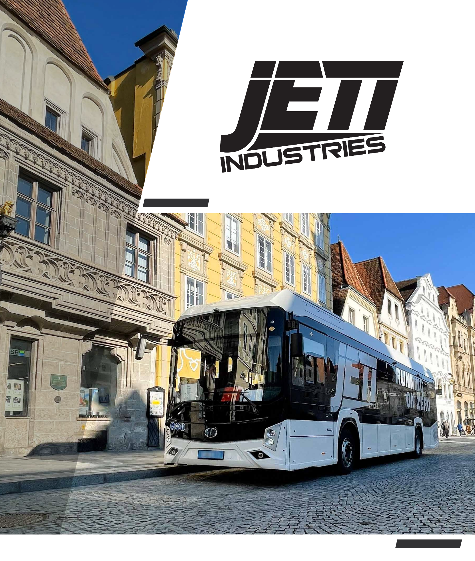
Running on Zero