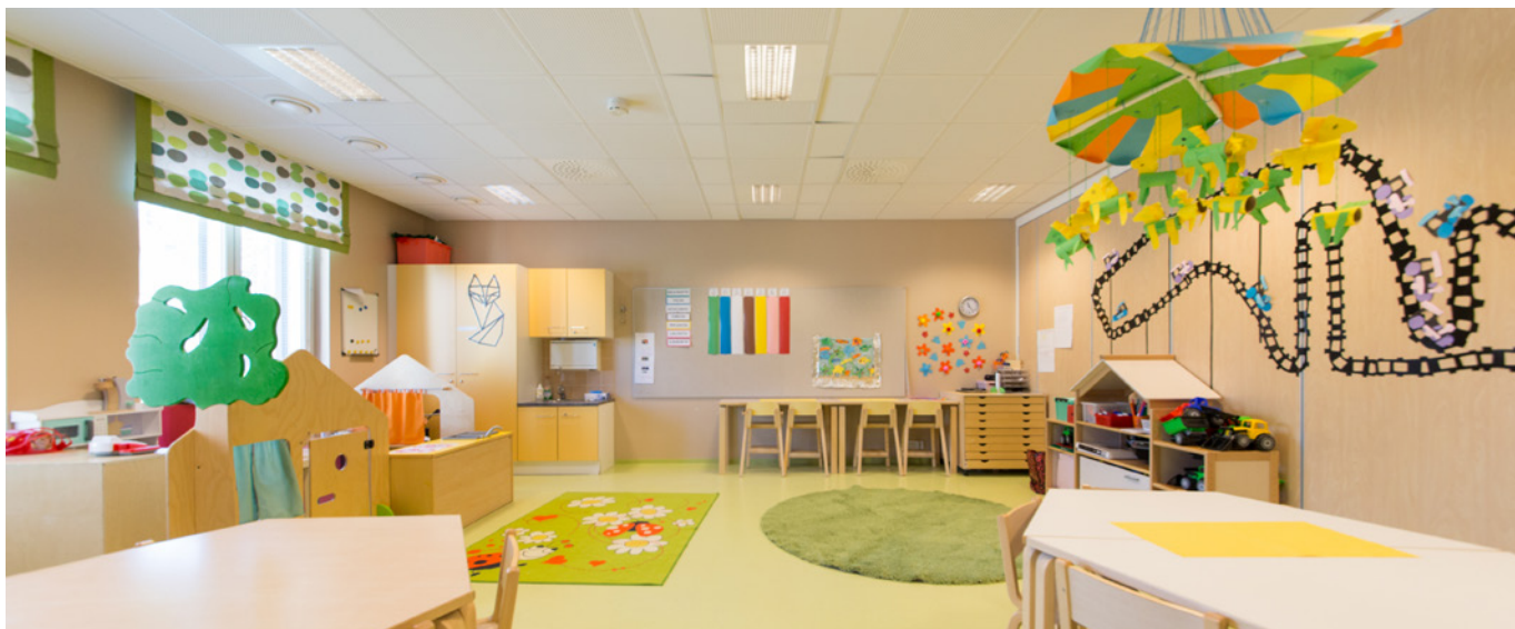
Kettukallio kindergarten in Kihniö town centre.

A library serving all residents is located in the same courtyard as the school and the day-care center, and the fenced yard has excellent opportunities for sports, play and other outdoor activities. There are also several playgrounds near the building of the school and day-care center.